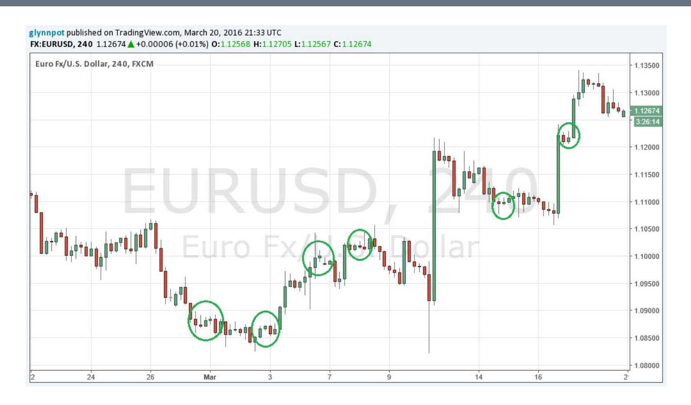
A suitable candle would consist of a ' Chubby' look with an opening and closing prices close to the days high and low as shown in the chart below. Quite often you will find two or more narrow candles together this only serves to contract the volatility and will often lead to an even larger breakout of the range to come.